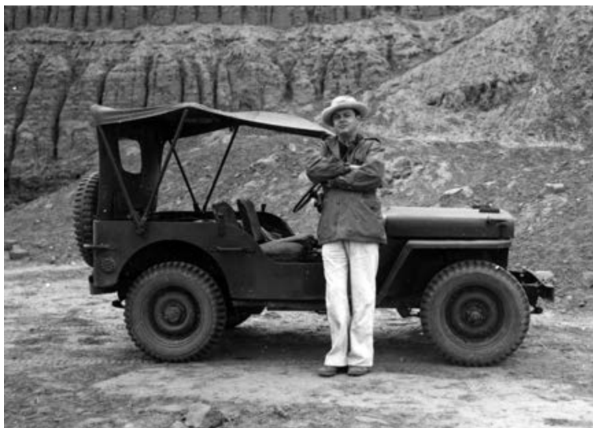
FIGURE 1.3. Gordon Willey in the Viru Valley, Peru, ca. 1946.