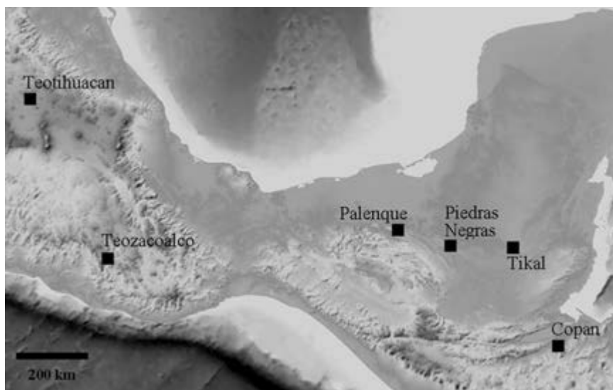
FIGURE 1.1. Map of Mesoamerican sites discussed in this volume.

other paradigms have significantly contributed to our understanding of the past. And while it has evolved in recent years with the incorporation of different perspectives, the core commitment of New Archaeology to a comparative anthropological basis, explanatory power, and scientific robusticity remains a key contribution of this perspective. The chapters in this volume highlight the applicability and sustainability of the concept of adaptation within the perspective of cultural ecology in archaeological research in Mesoamerica, and particularly in the Maya area.