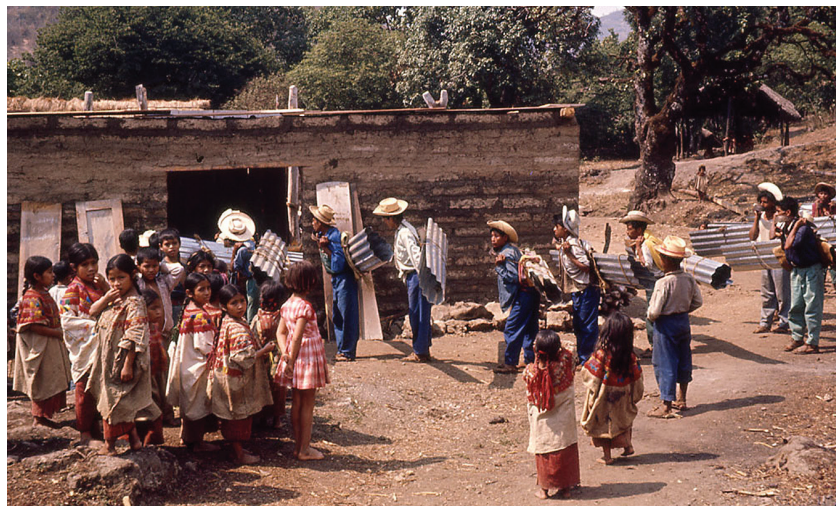
FIGURE 1.13. During our dialect survey, tin roofing arrives for the new Catholic church in the aldea of Xubojasun ( xub'oj asun , “breath of the clouds”), municipio of Nentón. May 1965.