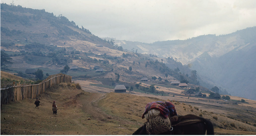
FIGURE 1.11. The San Mateo aldea Patalcal ( pat alkal , “house of the mayor”), May 1965. The entire countryside was shrouded with smoke from an uncontrolled brush fire. Photo by the author.