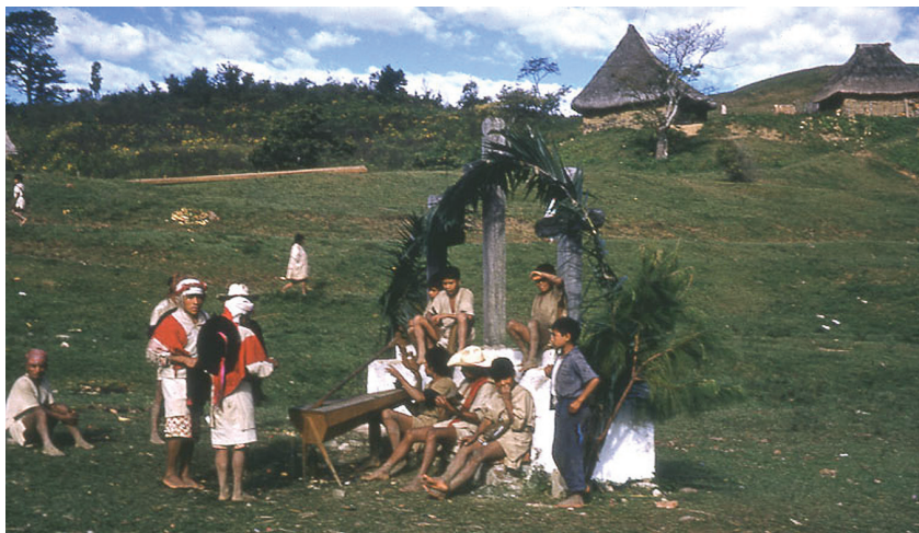
FIGURE 1.7. Capitanes perform at the crosses in front of the church in the center of downtown San Pablo Chalchihuitán, Chiapas, 1961.