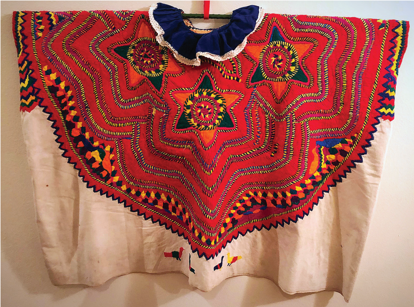
FIGURE 1.4. The newer design of the San Mateo Ixtatán huipil, kolob'nip .