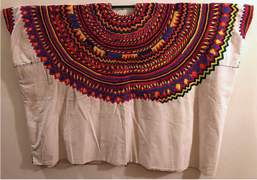
FIGURE 1.3. The older design of the San Mateo Ixtatán huipil, lak'an nip .