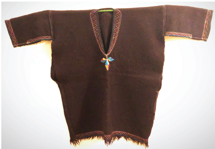
FIGURE 1.5. The San Mateo Ixtatán men's jacket, lopil (Spanish capixay ).