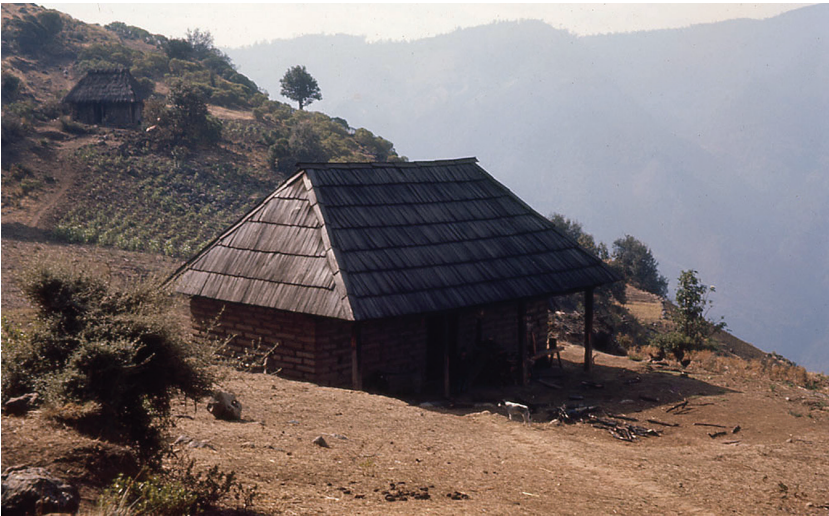
FIGURE 1.12. A typical house in Patalcal: walls of adobe, roof of wood shingles. The porch and patio in front of the house are the principal work areas.