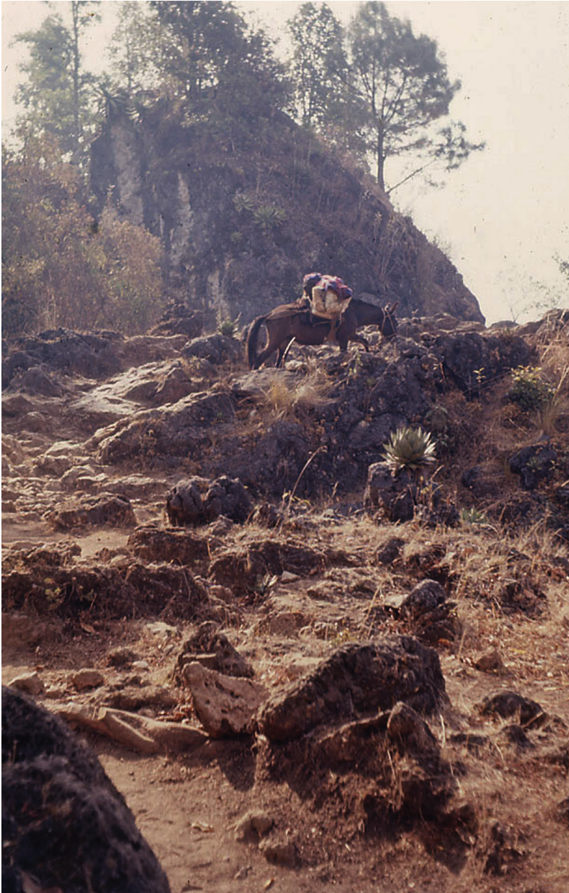
FIGURE 1.15. On the trail in the Yolcultac ( yol k'ultak , “center of the brushland”) forest, municipio of Nentón. May 1965, at the end of the dry season.