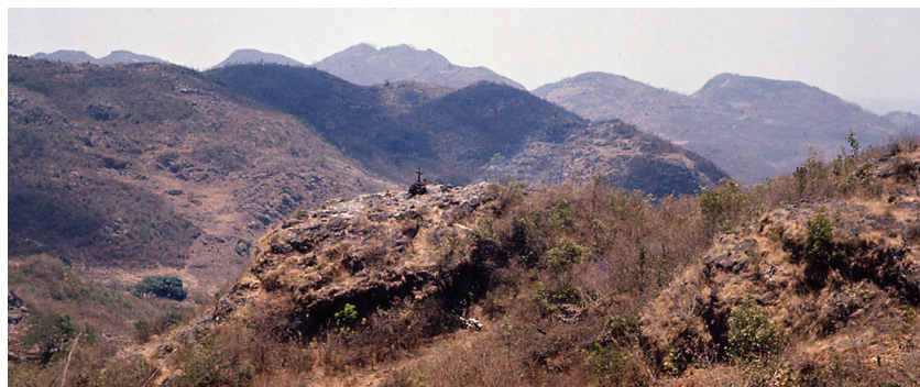
FIGURE 1.14. Cross shrine on a rock outcrop on the outskirts of the aldea of Canquintic ( k'ankintik, meaning unknown), municipio of Nentón. May 1965. A woman in a red huipil kneels to the left of the cross. Entering the village with a loaded mule, I was hailed by a woman who ran from her house to ask “ Tas ha chonho?,” What are you selling?

job at Florida State University and I began to work there as an adjunct professor. We concentrated our field work on Chol and our academic work on Maya hieroglyphics.