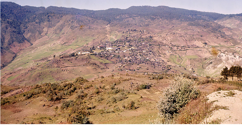
FIGURE 1.8. San Mateo Ixtatán ( ko chonhab', “our town”), seen across the valley from the road to Barillas. August 1964. The road from Huehuetenango is visible above the town. Below it, the church, and to the left the school and the precolumbian ruins of Guaxaclajún ( Wajxaklajunh, “eighteen”). The salt mines lie below the town, above the (unseen) river.