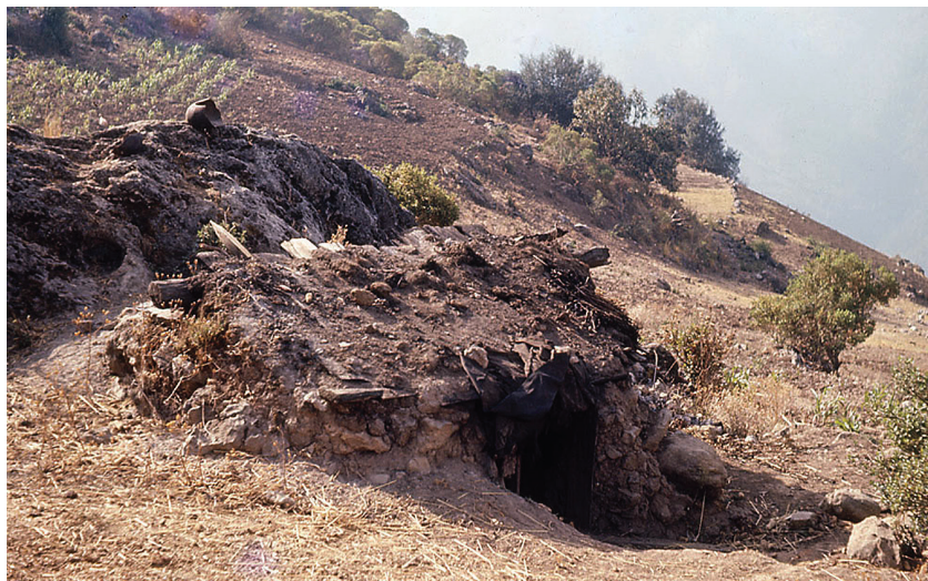
FIGURE 1.2. A typical sweatbath (Chuj ikaj ). The Mam term for sweatbath, chuj , provides the name of the language of their northern neighbors. Patalcal, May 1965.

the neck. This element of clothing (Chuj lopil ) must have been introduced by priests from northwest Spain, because the Spanish word capixay comes from the Basque capo sayo , vulture cape. These wool tunics are prominent in trade. Their makers carry them across the Mexican border to Comitán, Chiapas, for sale; throughout highland Chiapas they are known as koton chuj or just chuj , and they are the typical men's jacket in Amatenango, between Comitán and San Cristóbal de Las Casas.