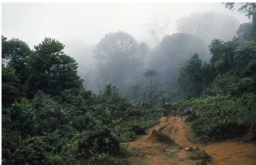
FIGURE 1.6. Vegetation along the trail from San Mateo Ixtatán to Bulej, May 1965.