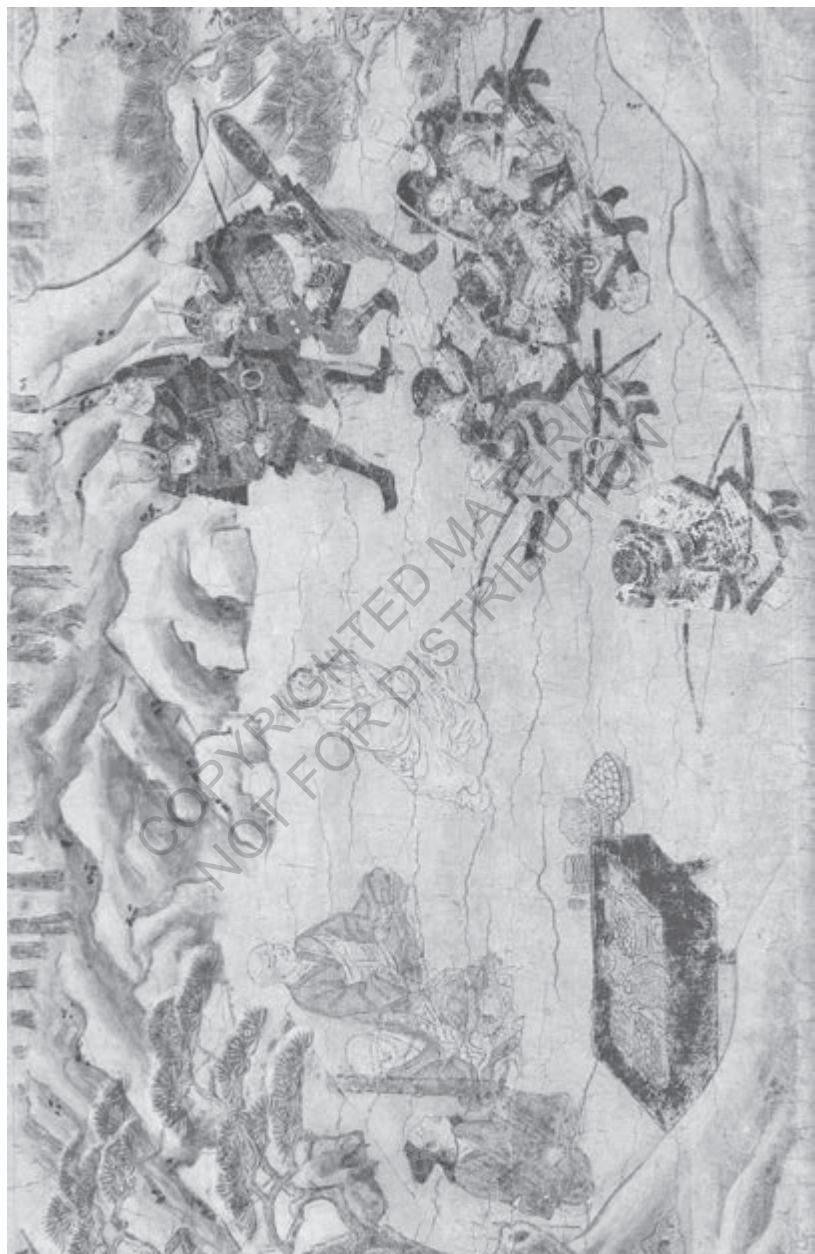
Figure 1.1. Raikō's troupe meets the elders in the mountain.