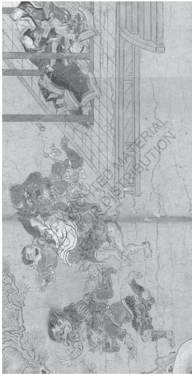
Figure 1.3. The oni who played the dengaku performance run away from Raikō.