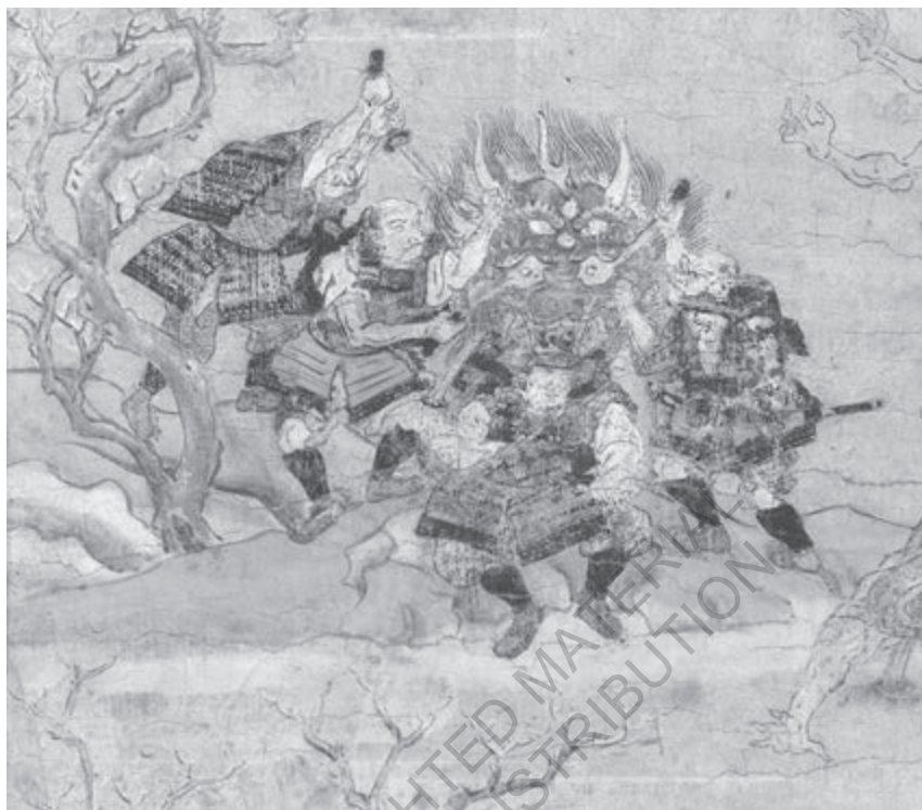
Figure 1.4. Shuten Dōji's severed head lunges at Raikō.

Jakengokudai? 87 Deceived by these men, I am now to be done with. Kill these enemies!" Hearing Shuten Dōji's voice, the decapitated oni rose from the ground and were running about without their heads.