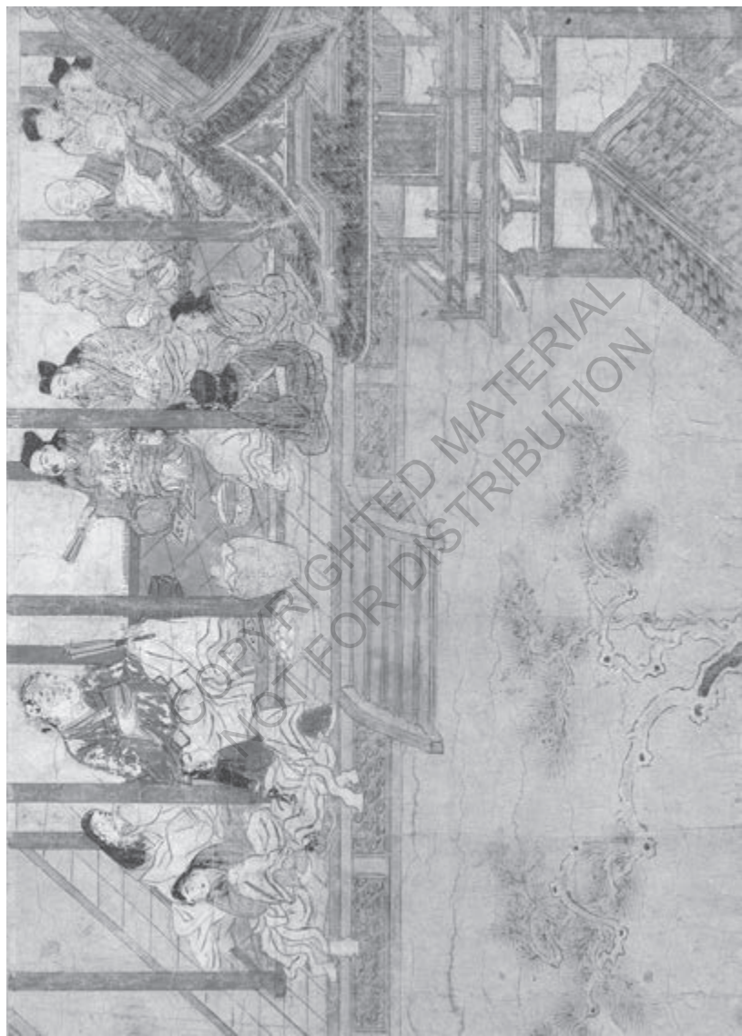
Figure 1.2. Shuten Dōji entertains Raikō's troupe with unidentifiable meat and blood.